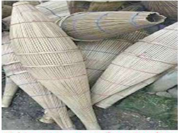
Fishing Instruments from Bamboo