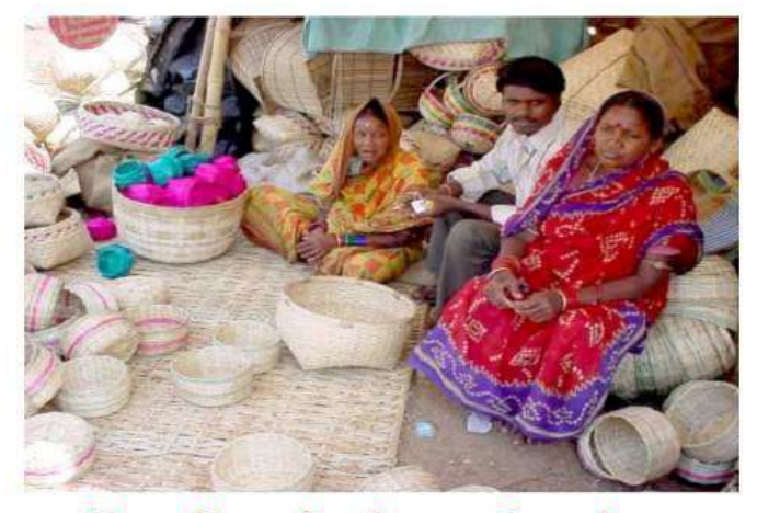
Handicrafts from Bamboo

propagation method, planting technique, growth, yield, income & expenditure per hector bamboo cultivation etc. through power point presentation.