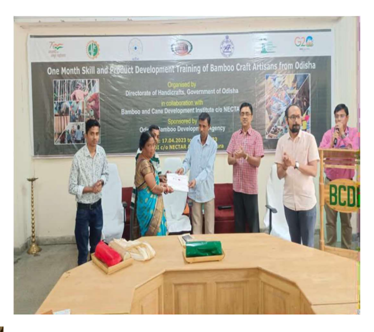
Some articles prepared by artisans at BCDI, Agartala during traning.

Valedictory Session during artisan training at BCDI, Agartala.